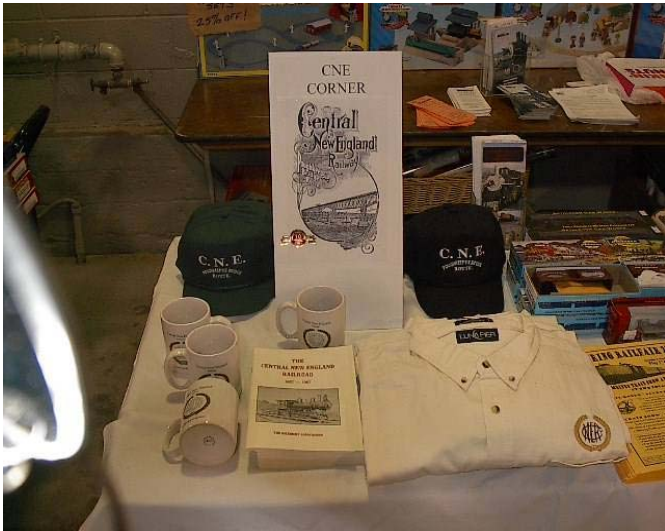
New arrivals: Stop in to see our new line of Central New England items. Caps, mugs, shirts, etc. While you're here check out other new items arriving daily.

Some photos from our display at the Amherst Show in Springfield, MA.