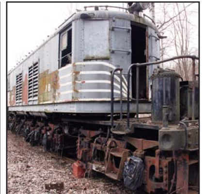
Rescue and restoration of two ex-NYC electric locomotives (1904 S1 (above, left) and 1926 T3a (above, right) motors)

Cut along dotted line and mail bottom portion in the enclosed envelope