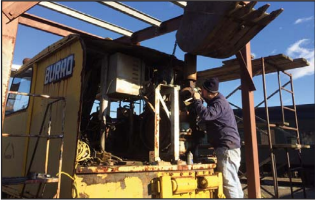
1947 ex-NYC Burro crane full restoration for yard maintenance and display

We rely on four sources for funding: Direct admission and special event ticket sales; merchandise sales in the Gift Shop; grants; and donations. It is in the last area where we need your help. Below are four projects that need additional funding. Recently, we have obtained a 1970 bay window caboose, formerly operated by the Erie-Lackawanna Railroad, one of ten such cars built for the carrier. It requires a considerable investment to restore it to its former glory. We estimate a total cost of $6,200 just for the replacement of all the windows.