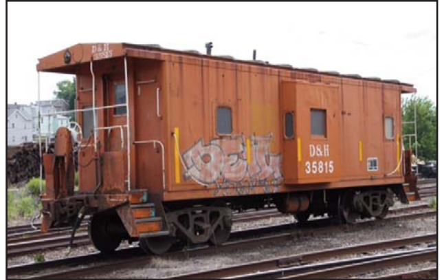
1970 EL bay window caboose needs window replacement and other restoration work