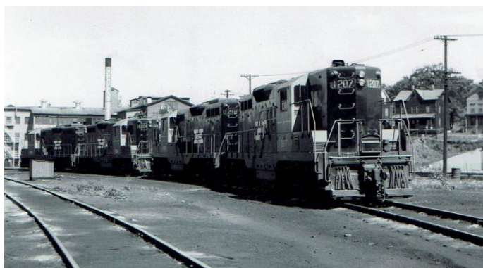
1207, 1218, 1224, & 1220 at Danbury, June 1957 Federal Fur Co in Background.

The two photos are of three electricians and four diesels I had just serviced.