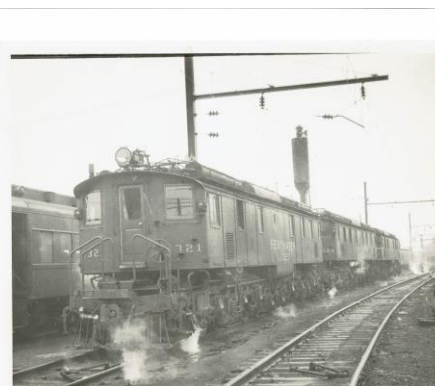
NHRR Motors 321, 324 & 320 at Danbury Motor Storage December 1956