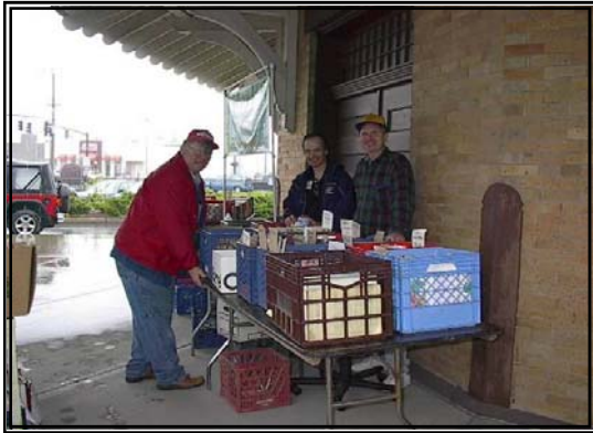
Some photos from our Train Show on May 1st and 2nd.