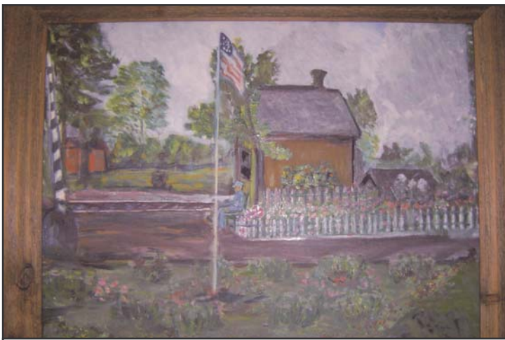
A painting of the crossing shanty at Main Street.

I remember Mom dropping us off while she went grocery shopping "downtown". We would all cram into the little shed and when the train was coming (after Grandpa got the call on the hotline) we would go outside and he