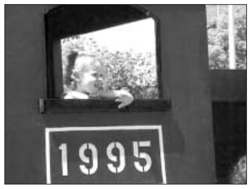
A visitor posing in the 1995 wooden engine