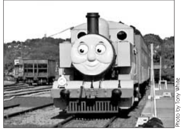
A visit from Thomas the Tank Engine July 13 - 15, 2001Danbury Railway Museum