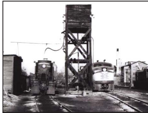
"A rare sight with FA's on Danbury, CT service track-0409"

Penn Central sold the 0428 to Long Island RR as a cab car, and it was renumbered 617.