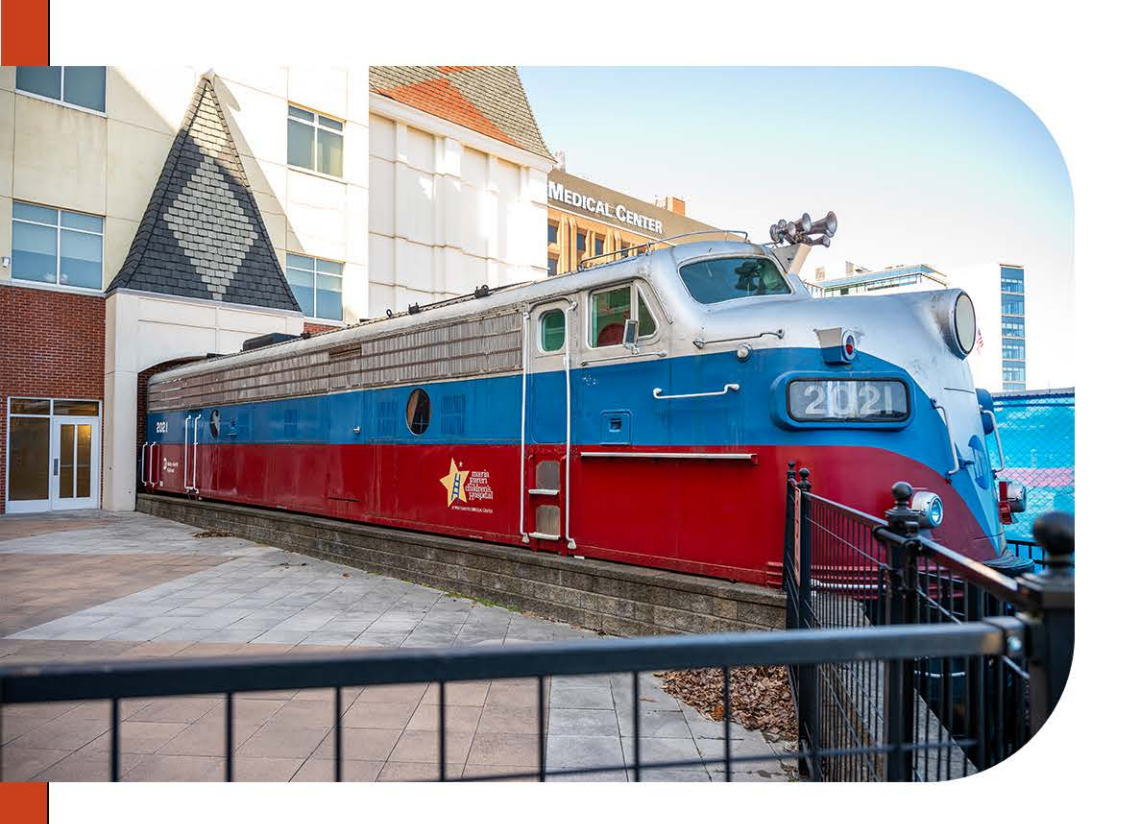
Side view of FL-9 #2021.

Donated by Metro North themselves, and trucked a short distance from the Harlem Line to the Hospital, hence the reason it was gutted. Though when looking for photos of the inside or just any in general there were none to be found documenting the inside, and any outside photos were very blurry or pixelated. So we decided we wanted to document this engine properly.